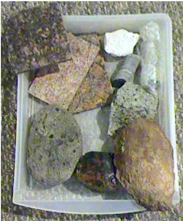
The second and third drawers contain samples of various igneous and sedimentary rocks.