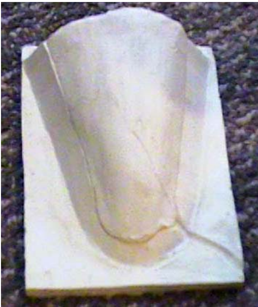
The third drawer also has a two-part model of an anticline to help show how what happens after weathering takes its toll on layers of rock.